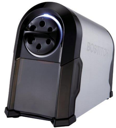
EPS14HC (date codes 1612 to 2715)