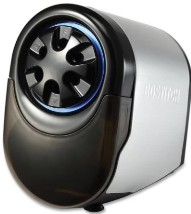
EPS11HC (date codes 4714 to 3215)

THE PENCIL SHARPENER MAY POSE A SHOCK HAZARD.