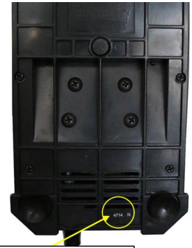
EPS14HC date code on bottom of sharpener

If your sharpener is affected, STOP USING IT IMMEDIATELY, and call toll free