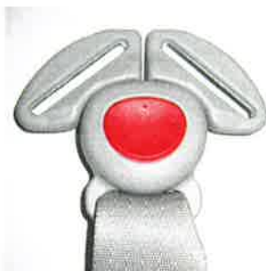
QT and QT3 Buckle

Specifically, the buckles may be difficult to unlatch or become stuck in the latched position making it difficult to remove a child from their car seat, and increasing the risk of injury in the event of an emergency requiring immediate exit from the vehicle.